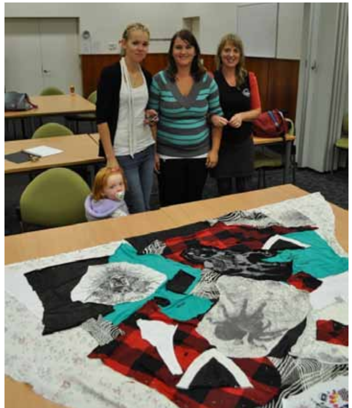
Participants in the fabric art project.